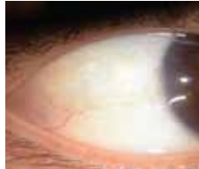
3 Right Temporal Sclera