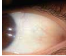
3 Left Temporal Sclera