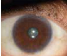
1 Right Iris