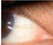
2 Right Nasal Sclera