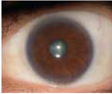
1 Left Iris